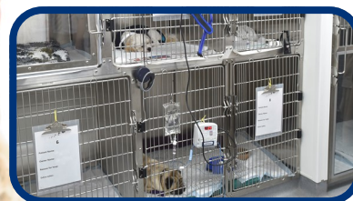
Separate Cattery and Kennels