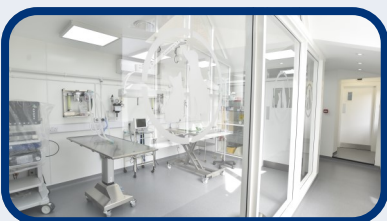
2 fully equipped operating theatres

Whether in the hospital or at our branches, we always offer the most up-to-date preventative healthcare advice and are proud of the facilities at our Hospital which was extended in 2016.