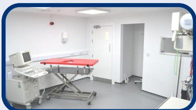
Diagnostic Imaging Suite